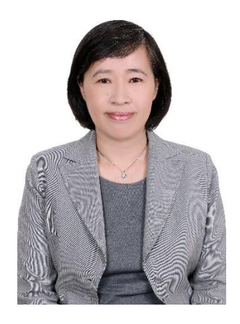
Shien-Quey KAO Deputy Minister of National Development Council